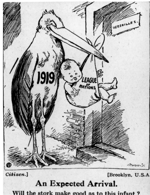
1919: A cartoon depicting the formation of the League of Nations after the First World War.