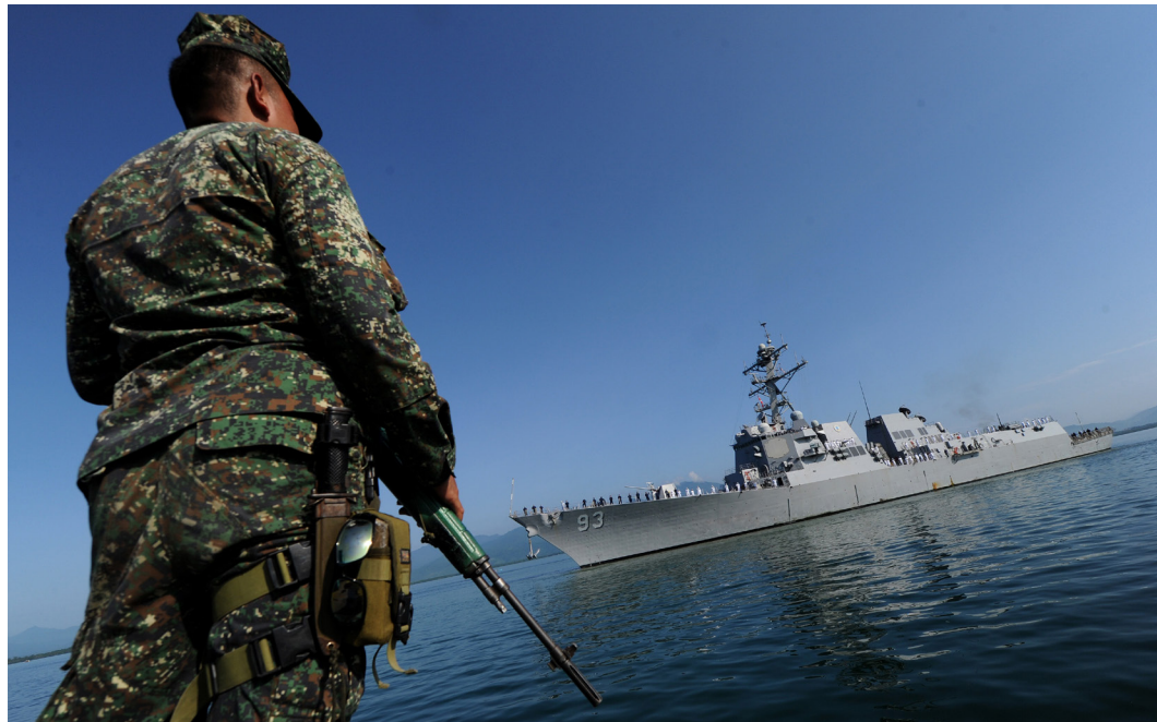
TOPSHOTS A Philippine naval personnel stands on guard during the arrival of missile destroyer USS Chung Hoon (DDG-93) before the US-Philippine joint naval military exercise entitled ‘Cooperation Afloat Readiness Training’ (CARAT) near the disputed Spratly islands, in Puerto Princesa on the western Philippine island of Palawan on June 28, 2011.