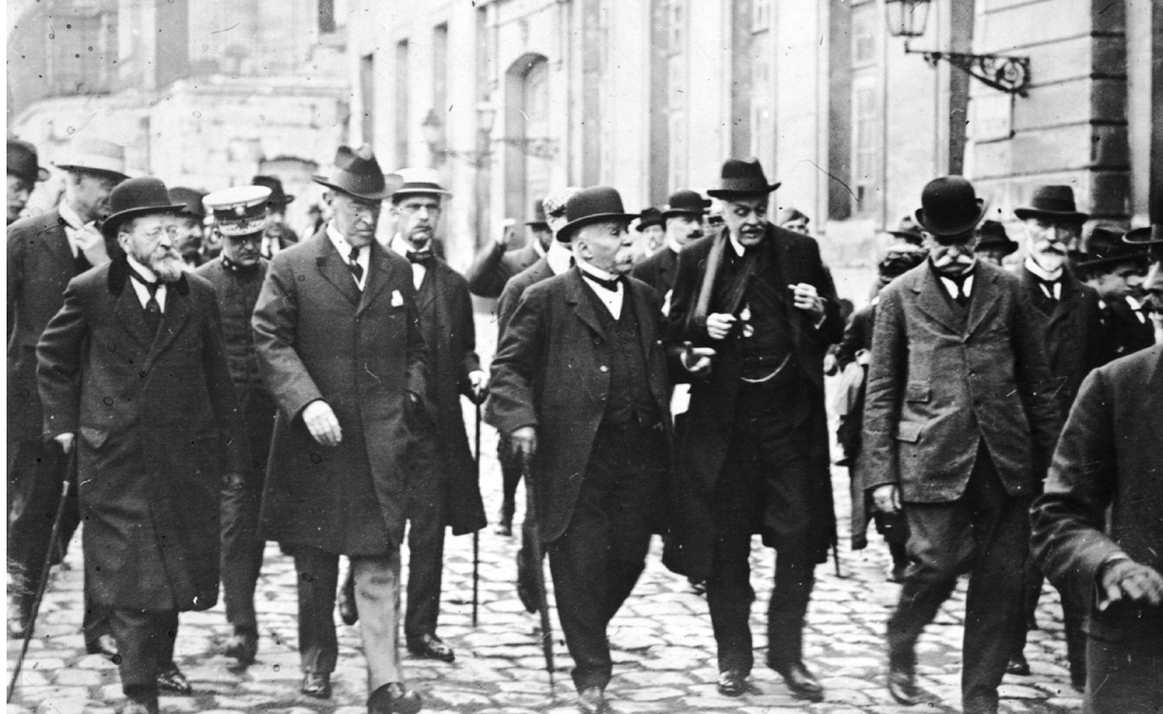
Delegates at the peace conference at Versailles, including, French Prime Minister Georges Clemenceau (1841 - 1929), and British foreign secretary Arthur Balfour (1848 - 1930), 1919.