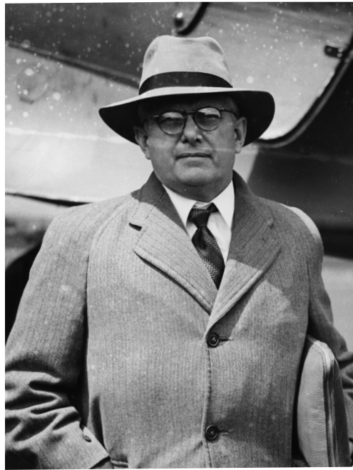
Australian politician Herbert Vere Evatt, former President of the United Nations General Assembly, circa 1955.

norms and purpose of the UN system were by and large compatible with U.S. interests and ideology. But U.S. leadership was discharged in other crucial ways, including making planning for the postwar world a wartime priority; allocating human resources to develop ideas; consulting extensively with other governments to build a critical mass of support; and organizing conferences where the structure, mandate, and operation of these organizations were hammered out. Allocating resources, providing logistical support, and cultivating multilateral cooperation were all essential elements of U.S. leadership.