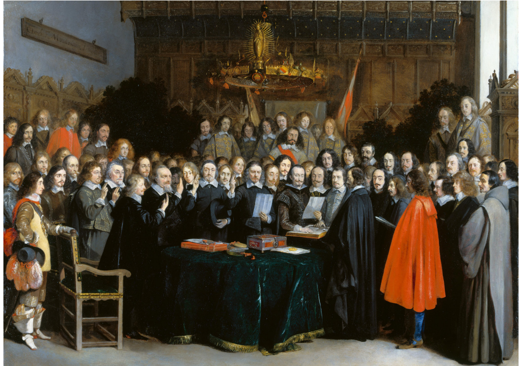
The ratification of the Treaty of Münster, Gerard ter Borch (1648).

retreating from the historical Westphalia, as some have suggested, it may be useful instead to take a fresh look at what the conference was, what it was not, and what guidance it can still offer to scholars and policymakers wrestling with the changing nature of global order today.