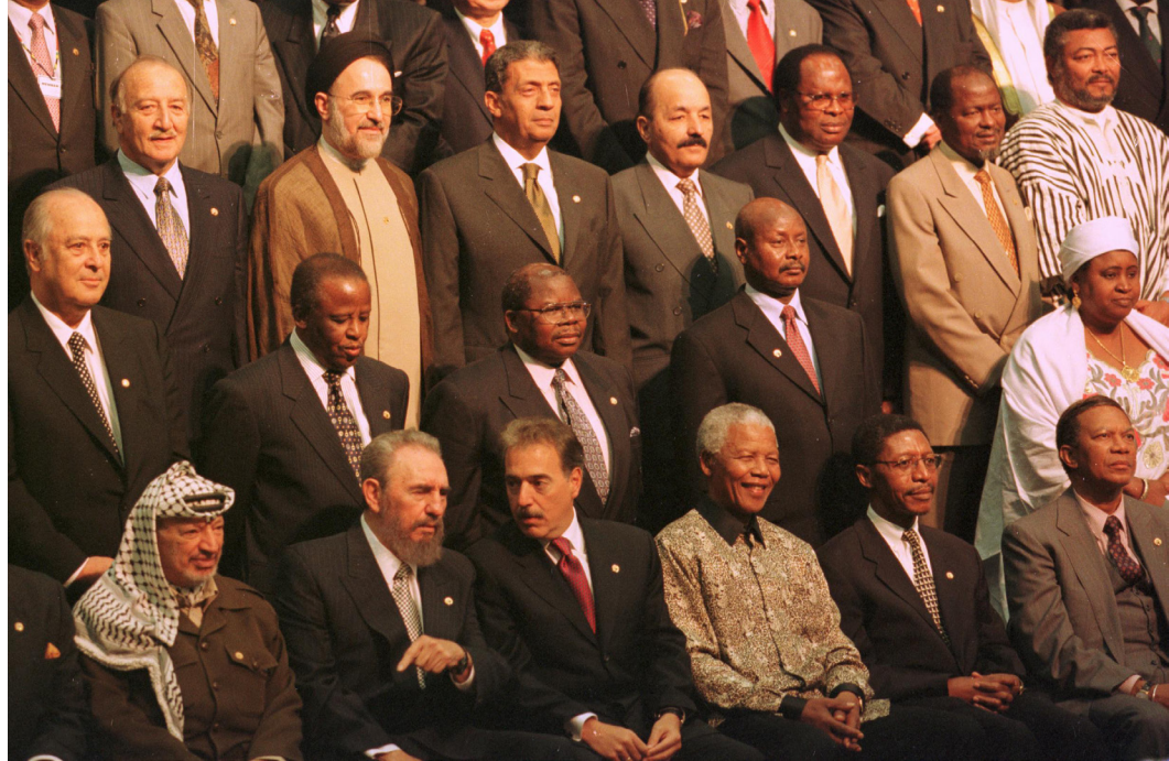
Heads of state and government and foreign ministers pose for the group photo opportunity at the 12th Non-Aligned Movement (NAM) summit in Durban 02 September.