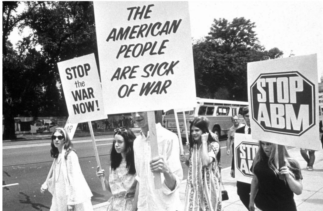
Students march with anti-war placards on the campus of the University of California at Berkeley, California, 1969.

hastened the erosion of the domestic consensus that had made Cold War internationalism possible in the first place. By the late 1960s, Congress was poised to slash U.S. troop commitments to the North Atlantic Treaty Organization (NATO), a threat that called into question the sustainability of the commitments that had made the Cold War order. 58