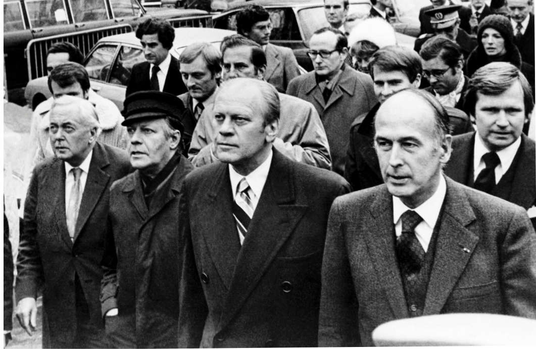
From left, British Prime Minister Harold Wilson, German chancellor Helmut Schmidt, US President Gerald Ford and French President Valéry Giscard d'Estaing arrive at the town hall of Rambouillet on November 17, 1975.